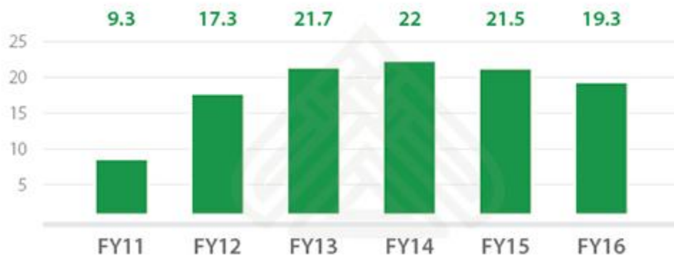
India's Exports of Processed Foods and Related Items in US$ (billion)